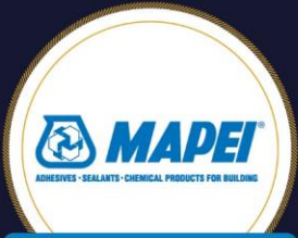
Mapei East Africa Ltd