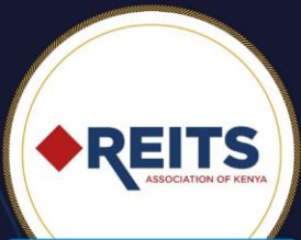
REITS Association of Kenya (RAK)