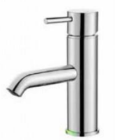
JML 7310-COZY washbasin faucet

faucet and toilet combining the self-designed water tank are a set configuration.