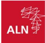
Anjarwalla & Khanna LLP