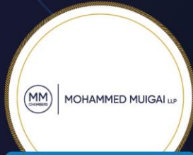
Mohammed Muigai LLP