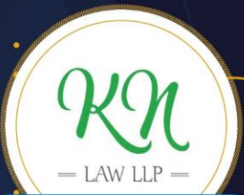
KN Law LLP