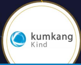
Kumkang Kind East Africa Ltd