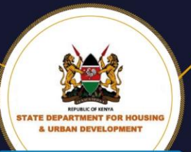
State Department of Housing and Urban Development