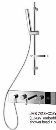
JMB 7313-COZY (Luxury-embedded) shower head + bathtub